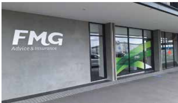
The new digs are at 62 Cass St, Ashburton